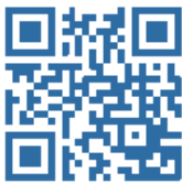
Official University Website

Telephone: (853) 2888 1122 Address: Avenida Wai Long, Taipa, Macau, China Official Website: http://www.must.edu.mo Official WeChat Account: 澳科大MUST