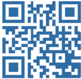
Official University Website