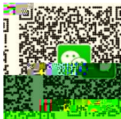
Official WeChat Account