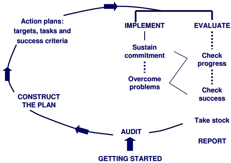
The development planning process (Hargreaves and Hopkins, 1991)

The process of development planning can be set out thus: